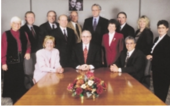
2000/2001 MeritCare Health System Board of Trustees and Corporate Officers